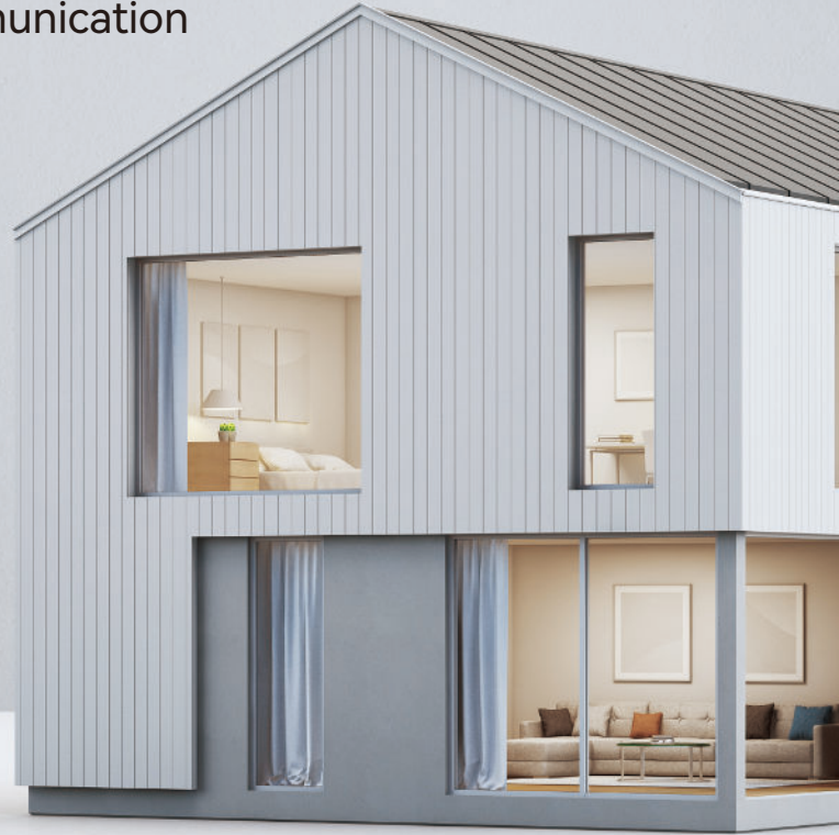
GroHome System Diagram